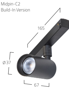
Midpin-C2 Build-In Version